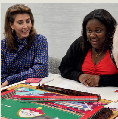
More open play sessions coming!